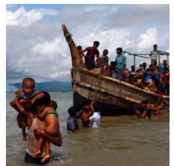
ROHINGYA REFUGEE CRISIS IN BANGLADESH: A SECURITY PERSPECTIVE

This flagship conference on the issues of climate security was hosted by the Ministry of Foreign Affairs of the Government of the Kingdom of Netherlands and was attended over 300 delegates from 60 countries. Read More