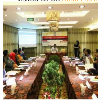
Bangladesh Institute of Peace and Security Studies (BIPSS) have organized a 3 day workshop on Countering Violent Extremism-capacity Building Programme (CVECBP).

On the 13th November 2017, a delegation from the think tank of the national Security Council secretariat of Thailand visited BIPSS Read More