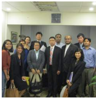
A delegation from the think tank of the national Security Council secretariat of Thailand visited Bangladesh Institute of Peace and Security Studies (BIPSS).

The delegation attended the review meeting of the joint project that BIPSS is conducting with NIAS on Climate Change Threat Mapping. Read More