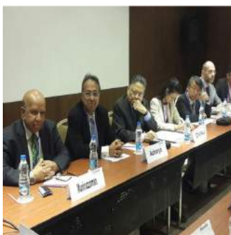
President BIPSS Maj Gen Muniruzzaman(Retd) attended and spoke at the Horasis Asia Conference in India.

The conference was hosted by the Ministry of Foreign Affairs, Qatar and the UCLA. Senior political leaders of the region, international experts Read More