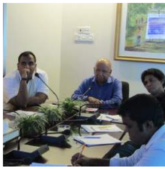
BIPSS HELD A ROUNDTABLE ON "UNDERSTANDING MYANMAR: MANAGING THE ROHINGYA REFUGEE CRISIS".

The Munich Young Leaders programme is a joint initiative of the Munich Security Conference and the Körber Foundation in Germany Read More