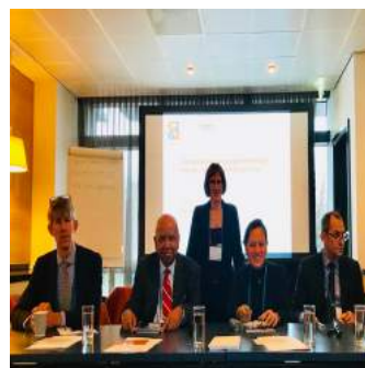
President BIPSS Maj Gen ANM Muniruzzaman, ndc, psc (Retd) was invited to speak at the Planetary Security Conference (PSC2017) in the Hague.

The conference deliberated on the critical linkages between climate change and resource scarcity. The dual impacts can have serious implications on regional stability and security. Read More