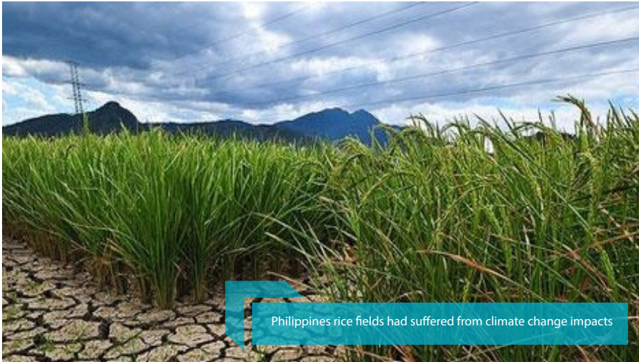
Philippines rice fields had suffered from climate change impacts